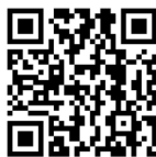
Reserve Prayer Room